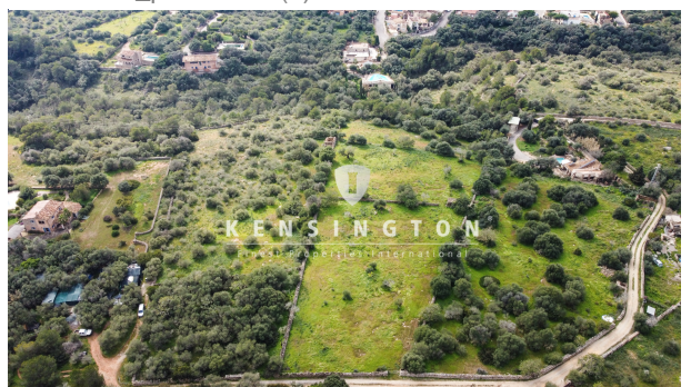
KPSO534_plot- view- (2)