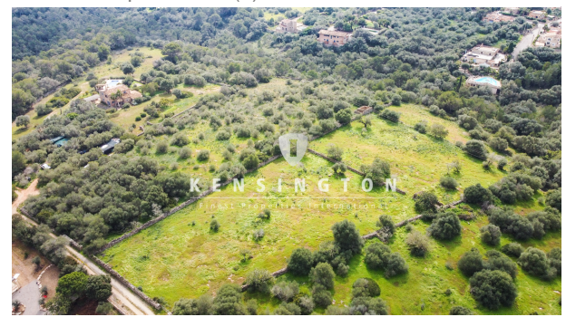
KPSO534_plot- view- (1)